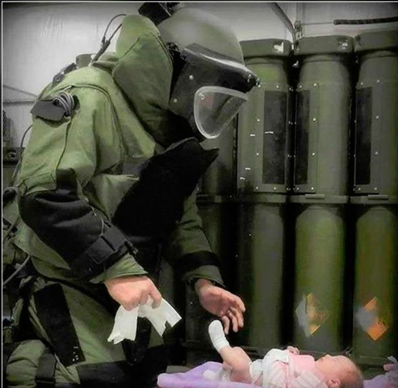
When it's Dad's turn to change the diaper...