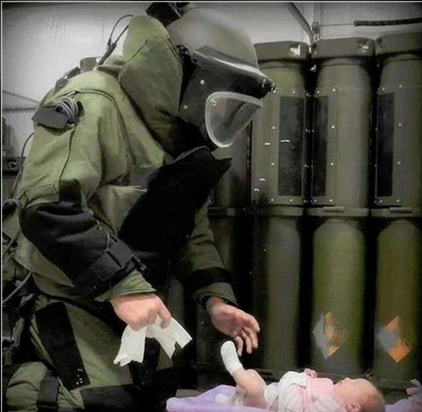
When it's Dad's turn to change the diaper...