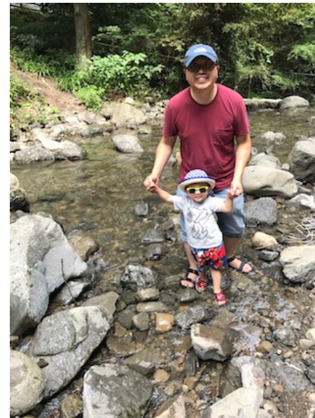
Playing in the river during the Hatta Nishi Church retreat in August.