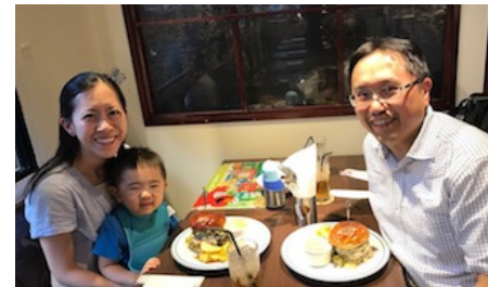
Celebrating 9 years of marriage in July.

3. Proclaim Conference: For safe travels and a profitable time for all who attend.