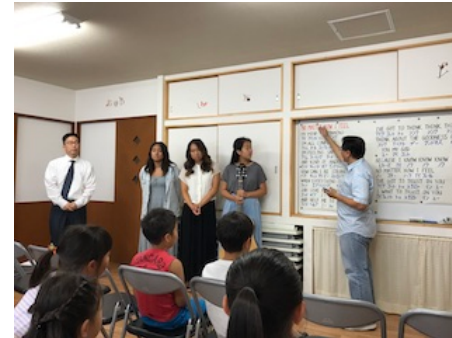
The team from Immanuel Bible Church in Santa Monica.