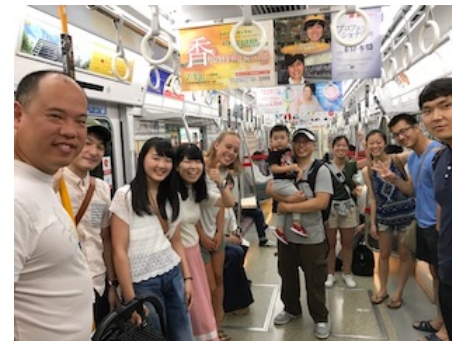
On the train with the Redeemer's Grace Church team and Hatta Nishi young people.