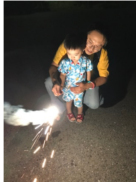
Fireworks are legal in Japan and popular in the summer.