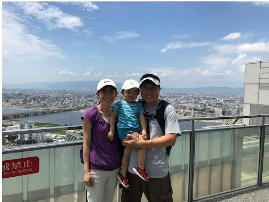
View of Osaka from the Umeda Sky Building

"Do you long to see those around you know Jesus? Are you praying for gospel opportunities in their lives? Look inside yourself: Is there sin that is preventing you from loving others? Fight for compassion in your life; fight for the ability to see others the way God sees others, not the ways the world sees others."