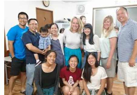
The team from Redeemer's Grace Church in San Diego.

Thank you for your interest in and support of our ministry! May the Lord continue to build His church and magnify His glory in Japan!