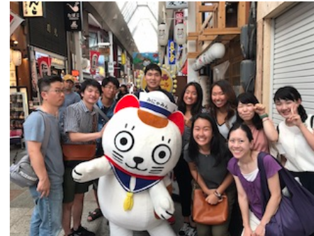
Exploring Namba with the Immanuel Bible Church team and some Hatta Nishi young people.

Despite the book's intimidating length, it's divided up into many bite-sized chapters which made it a lot easier to handle than it initially seemed. The book revolves around seven main topics: 1) worldviews (ways of perceiving the world), 2) cognitive processes (ways of thinking), 3) linguistic forms (ways of expressing ideas), 4) behavioral