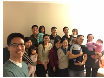
Open House with friends in San Jose.

you're going to have to read the book (though some of you might just look them up on Wikipedia). Also, you might have noticed that some of them lived very brief lives. I personally found some of those stories the most compelling. The bottom line is that I highly recommend this book to everyone. It's a very quick and easy read and you get both Bible and biography when you read it. I don't know if this book will lead you to go to the nations or further confirm your conviction to stay where you are but I do know that reading this book will lead you to deepen your love for God and the lost.