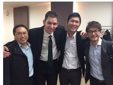
At the Proclaim Conference in Tokyo.