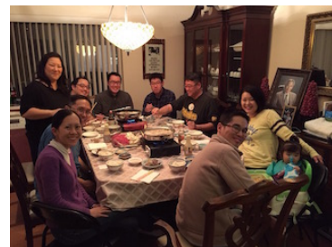
One of many dinners with friends in Los Angeles.