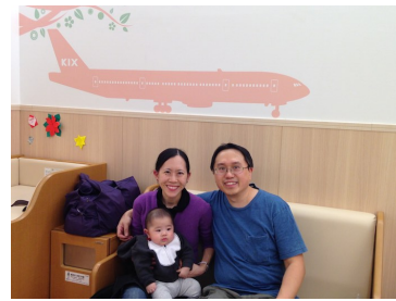
At Kansai International Airport.