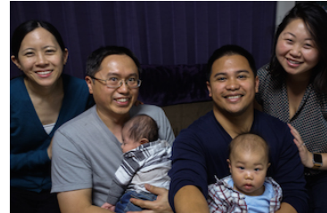
Friends from IBC visited us in Japan in October.

3. Family: That we would honor the Lord in our marriage, parenthood, and family relationships.