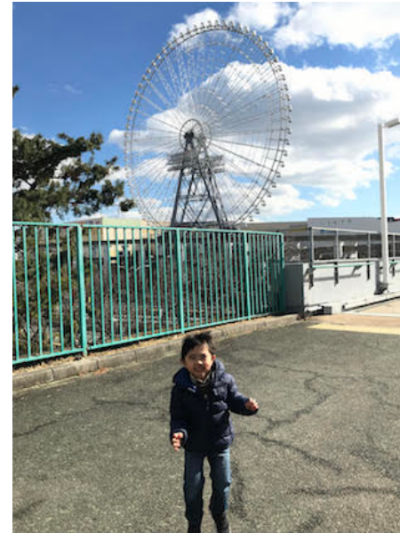
The largest ferris wheel in Japan is in Osaka.

If you are interested in learning about church planting and appreciate millennial humor, this would definitely be an enjoyable read for you. Like all the other 9Marks books, it is not overly technical or very long. You can probably read it in a day if you have a few spare hours. But, yes, as I already indicated in the beginning, I think this a good book and should be read by anyone who's considering church planting or is currently church planting.