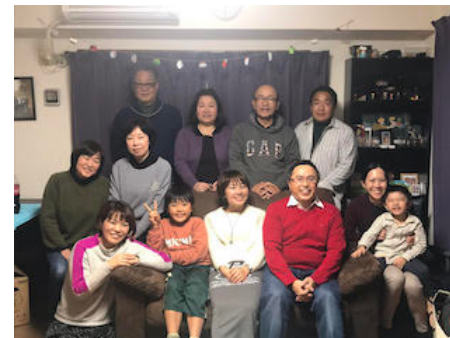
Christmas dinner with Hatta Nishi friends.