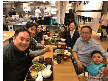
Sharing a meal and precious fellowship with some IBC friends who visited us in December.