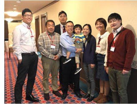
At the JBA Proclaim Conference in Tokyo with some Hatta Nishi members in November.