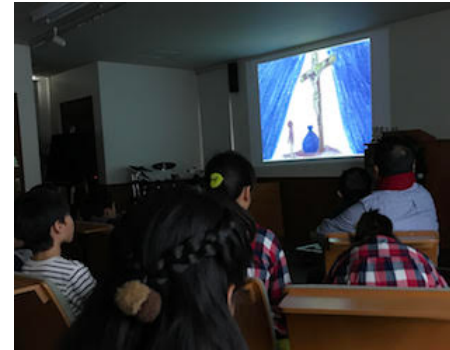
Children watched a gospel-sharing video at a Christmas outreach event at Hatta Nishi Christ Church.