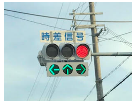
The red on this traffic light doesn't