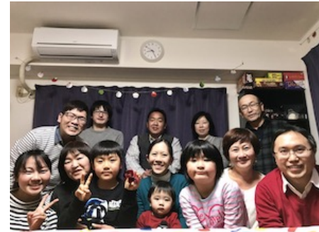
Christmas with Hatta Nishi members and friends.