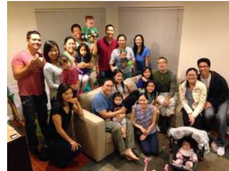
Meeting friends in Northern CA in October.