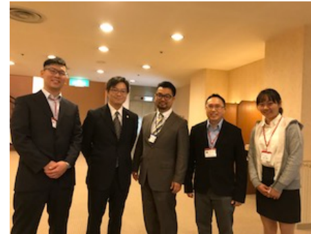
A few Hatta Nishi members with the Proclaim Conference speakers.