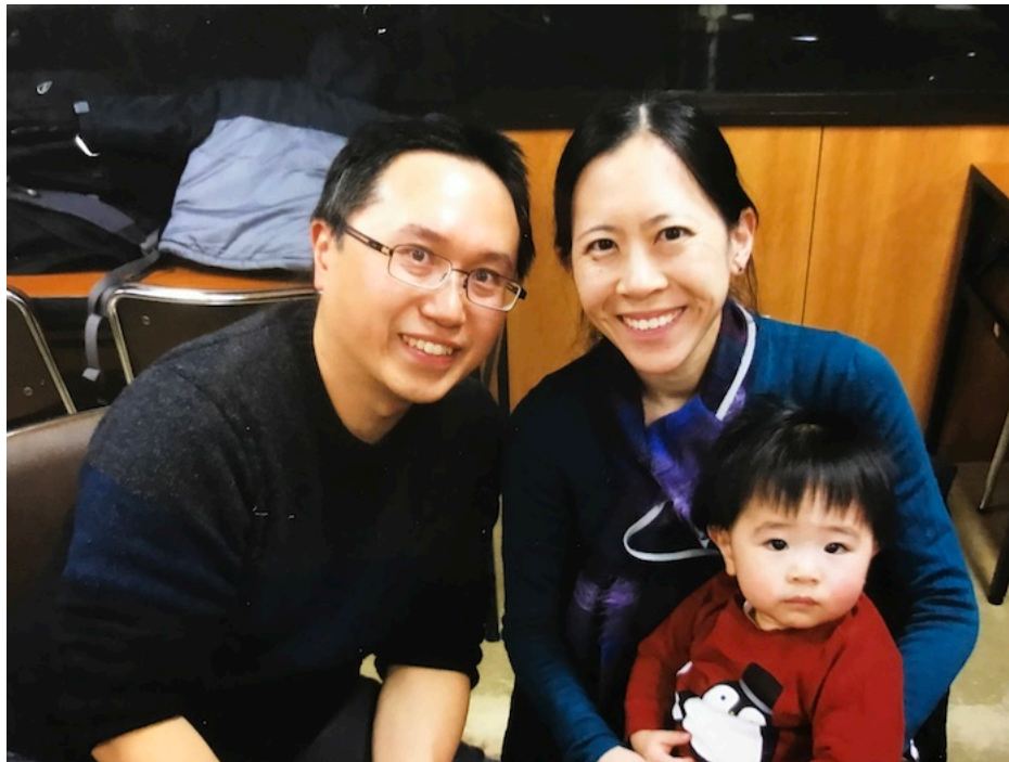
At a Japanese community center Christmas party

"Now the Church is a missionary body, and we must recapture this notion that the whole Church is a part of this witness to the Gospel and its truth and its message."