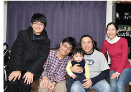
With Japanese friends from Izumisano.

I don't think this book is for everyone. It's not a theology, a devotional, or