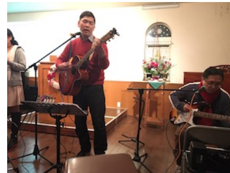
Hatta Nishi Christmas service.