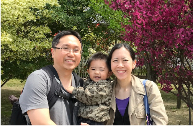
Spring time in Japan