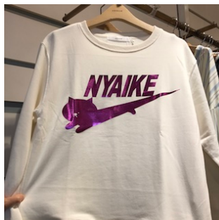
Cats in Japan say, "Nya nya," instead of "meow."