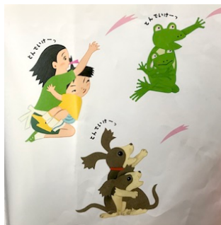
Japanese moms throw away pain instead of kissing a wound and making it all better.