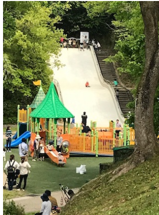
Giant slide at a park for a Hatta Nishi children's event.