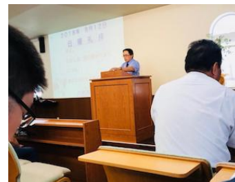
Ray preached again in August.