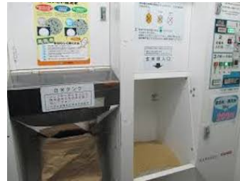
In Japan, you can hull your own rice using a public rice hulling machine available at home improvement stores.

To support the Kwans in Japan long-term: