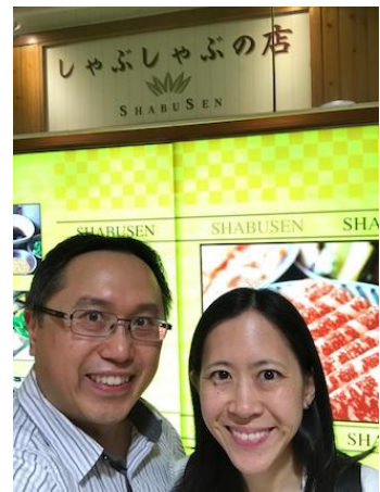
On July 12, we celebrated our tenth wedding anniversary!