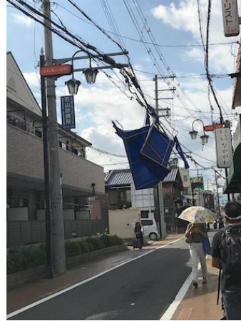
Typhoons in Japan are distinguished by a number, not a name. This photo was taken after Typhoon #21 (a.k.a. Typhoon Jebi).