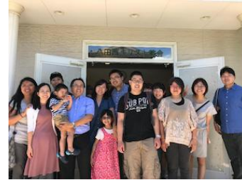
The IBC missions team with some Hatta Nishi members.