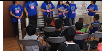
Introducing the IBC team.

new kids from the neighborhood, during the Joyful Kids VBS outreach program on August 2-5. Please continue to pray for the salvation of the children and the continued spiritual growth of Hatta Nishi members.