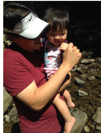
At the Hatta Nishi annual church retreat.