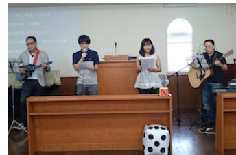
Celebrating seniors for Keiro No Hi (Respect for the Aged Day) with a musical performance at Hatta Nishi.