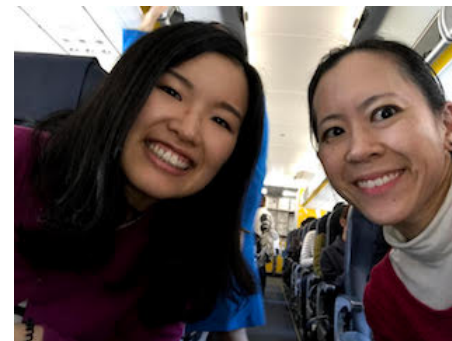
Traveling to the Proclaim