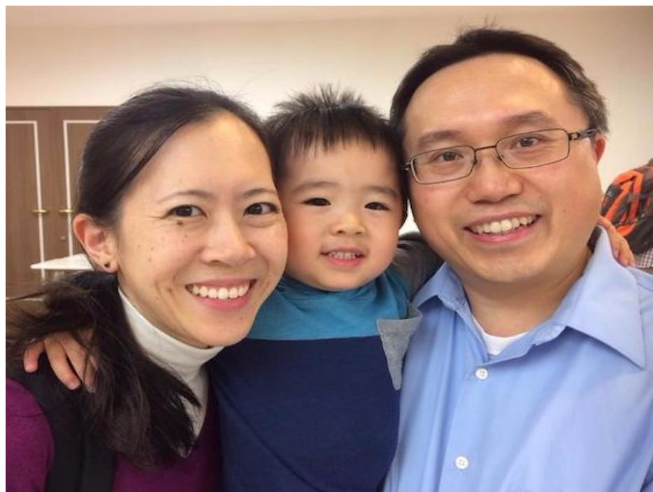
At the Japan Bible Academy Proclaim Conference in Tokyo

"If we're ever going to do anything for God, we need to be broken men, broken for the people to whom God has called us."